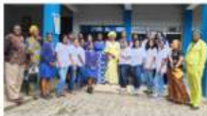
A group photograph with a former principal