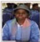
WPs' Student Affairs