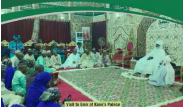
Visit to Emir of Kano's Palace

Federal Secretariat Complex, Phase III, Shehu Shagari Way, Central Business District, Federal Capital Territory, Abuja, Nigeria.