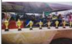
Display of trophies for inter-house sports competitions