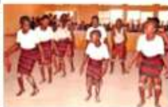
A cross-section of the Dignitaries