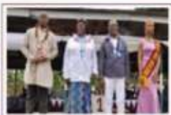
Director/Principal & PSA Chairman