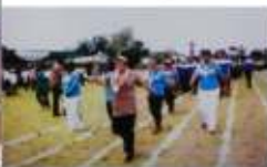
Principal leading the management staff march past