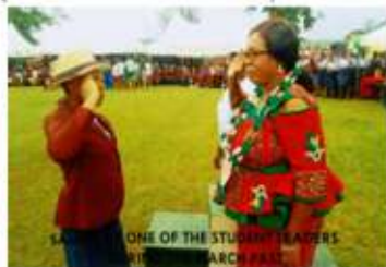
SAVING ONE OF THE STUDENT LEADERS AT THE MARCH PAST

there was a 4x100m Relay Race by the junior and senior students which was necessitated by students urge to participate in the