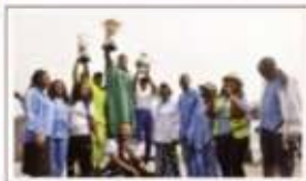
Winning House, Jasmine