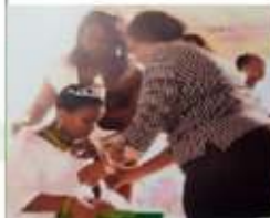
Decoration of the Commonwealth Queen by The Vice Principal Academic Cluster School, Dr. Mrs. ANNNXXX