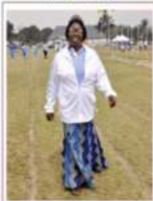
Director/Principal in action