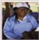
WPs' Acad 2