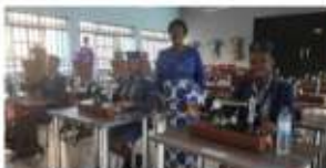
Queen's College furnished garment studio