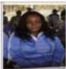
WPs' Acad 1