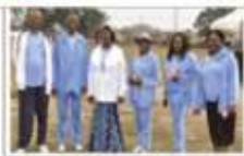
Director/Principal & WPs