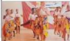
Rivers Cultural Group

In conclusion, the school management ensured that students and members of staff participated fully in the global program.