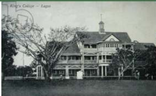
King's College, Lagos

The need to use these FGCs schools as instruments for strengthening the bond of