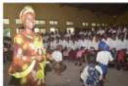
The principal and some students